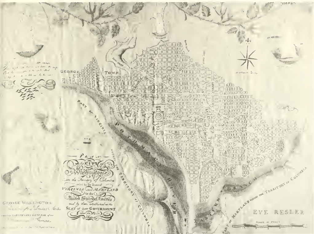
Map of Washington (city of) by Eve Resler; silk on silk; Virginia (unspecified); c. 1810. HOA 18 \frac{3}{8} "; WOA 25 \frac{3}{8} ".